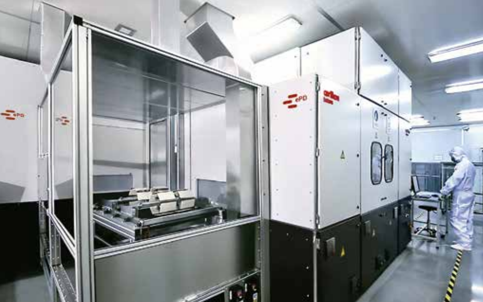
The INUBIA system allows seamless integration of ePD technology into the industry's production lines.

M etallized plastic parts have the same high quality appeal as chromium-plated metal components. To date, galvanic processes have been chiefly used in their manufacture: this involves the application of metal ions to plastic parts in an electrolytic bath. Galvanization however requires both hexavalent chromium (CrVI) and nickel.