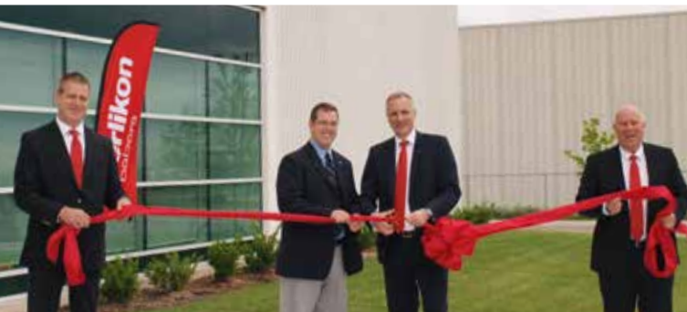
The new customer centre in Guelph, Canada (above left), the team in Guelph (above right).