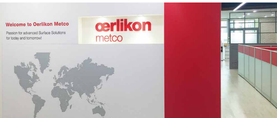
The new Oerlikon Metco sales office in Seoul, South Korea.