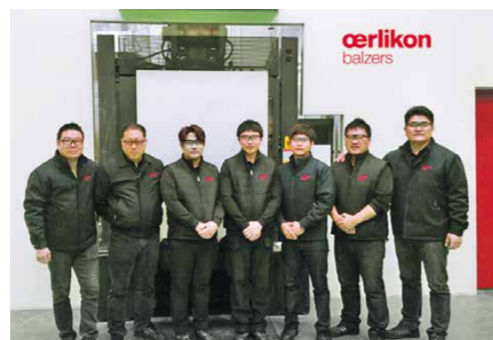
The new Oerlikon Balzers Customer Centre and its customer service team in Gwangju, South Korea.