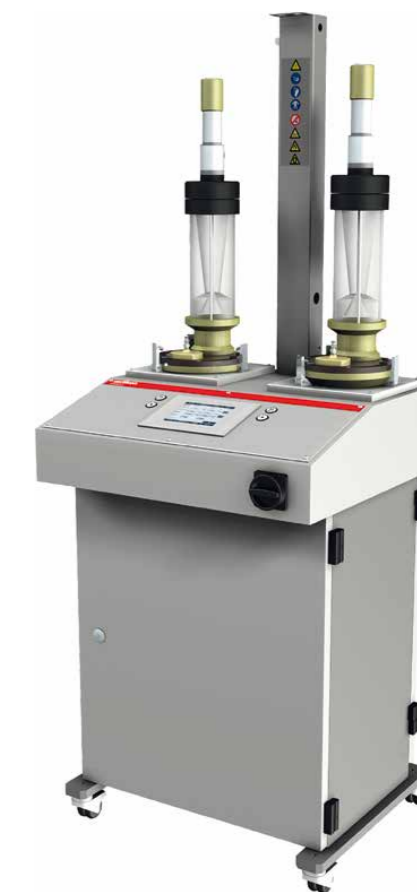
The new Twin 150 Powder Feeder from Oerlikon Metco meets the needs of many different powdered manufacturing processes.

Oerlikon Metco's volumetric powder feeders have long been a favorite of laser cladding manufacturers as a result of the accuracy of the feeding mechanism, even at very low feed rates. The new Twin 150 feeder, with its ability for full system integration, is expected to be an attractive choice for manufacturers of powder-fed laser cladding, additive manufacturing and thermal spray systems. ●