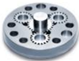
Fig. 6: Gear metering pumps: The perfect choice for all applications.