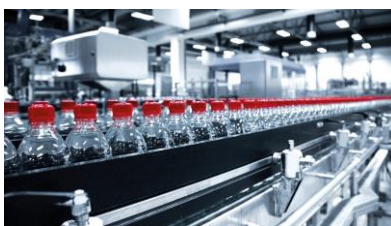
Fig. 5: Energy efficient production of PET bottle grade granulates.