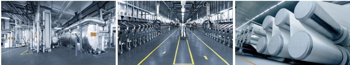
Fig. 1-3: From Melt to Yarn, Fibers and Nonwovens – Oerlikon will be presenting its latest machine and plant solutions at the ITME.