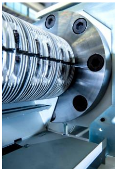
Fig. 4: Extrusion Plant Solutions: Mechanical produced melt for manmade fibers.