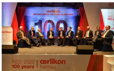
Fig. 14: Oerlikon round table discussion in Daman, India.