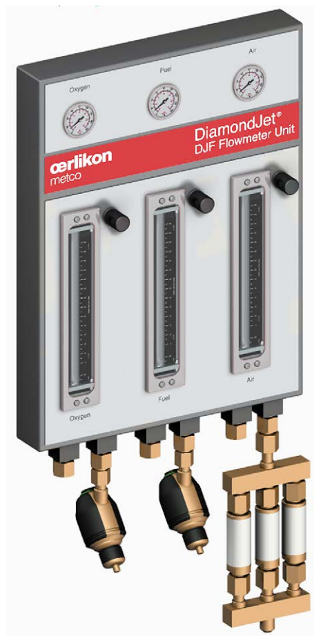
DJF Gas Flowmeter

When used as part of a complete manual Diamond Jet HVOF spray system, the DJF will provide precision control, while providing a simple means of maintaining the accuracy required.