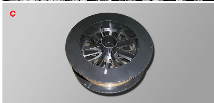
A: Typical morphology of gas-atomized products. B: Typical morphology of water-atomized products. C: Dorn-style spool for wire products.